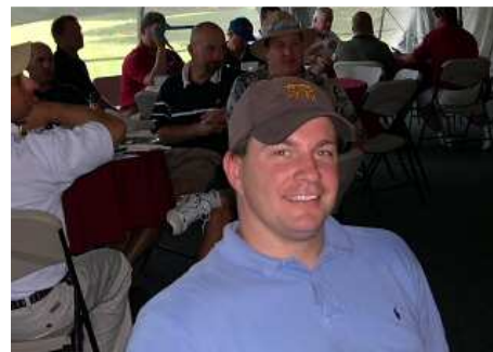
One of the happy winners from the BOSGO golf outing at New England Country Club

Beacon Mutual Insurance - Raffle Sponsor Liberty Mutual - Program Sponsor Marsh USA - Sponsor, Longest Drive Contest Safety Inc. - Sponsor Gift, 3 ball sleeves for golfers Air Duct Services - Hole Sponsor Aon Risk Services - Hole Sponsor - Hole Sponsor Atlantic Charter Insurance - Hole Sponsor Boston Claims Mgmt Co - Hole Sponsor Boston University EHS Dept - Hole Sponsor Canberra - Hole Sponsor Clayton Group Services - Hole Sponsor Mass Safety Council - Hole Sponsor SLS Consulting - Hole Sponsor PSC Environmental Services - Hole Sponsor