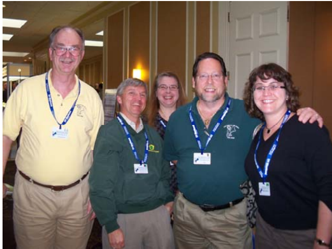
The Band from Boston

Another event-filled PDC has come and gone. Thanks to all who made this another great success. The PDC is always a great opportunity to gain knowledge, learn about new products, network with new friends, and catch up with old friends.