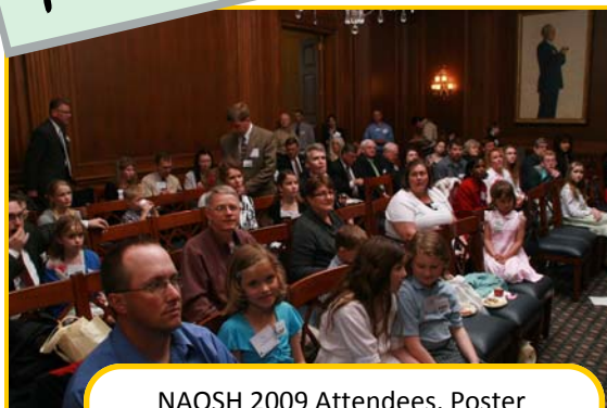
NAOSH 2009 Attendees, Poster Contest Winners and Families at the US Capitol

Put NAOSH Week May 2—8, 2010 and May 5, 2010 OSHP Day on your calendar!