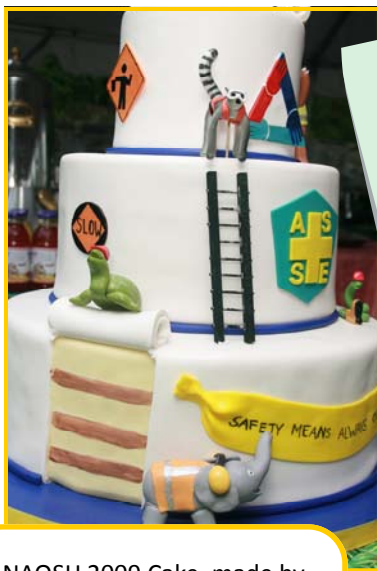
NAOSH 2009 Cake, made by Charm City Cakes

Put NAOSH Week May 2—8, 2010 and May 5, 2010 OSHP Day on your calendar!