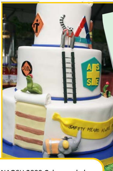
NAOSH 2009 Cake, made by Charm City Cakes

Put NAOSH Week May 2—8, 2010 and May 5, 2010 OSHP Day on your calendar!